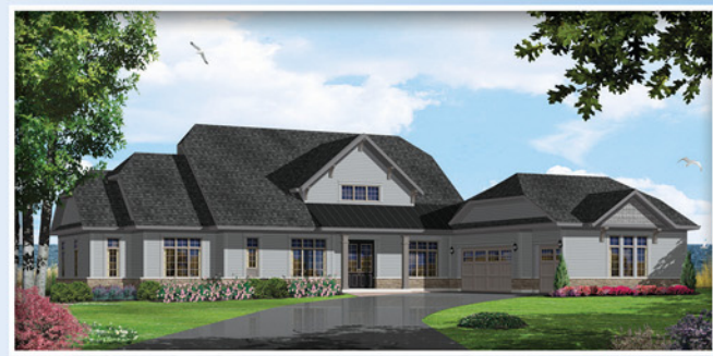
Bungalow Loft Elev-B -3213 sq.ft.