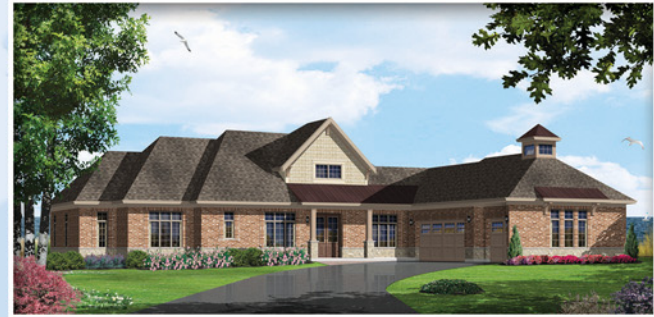
Bungalow Elev-A -2336 sq.ft.