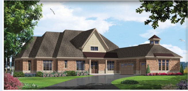
Bungalow Loft Elev-A -3202 sq.ft.