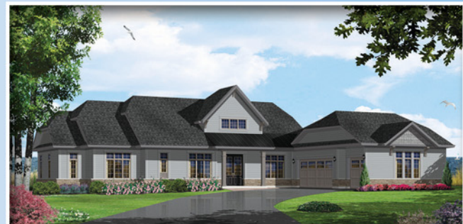
Bungalow Elev-B -2336 sq.ft.